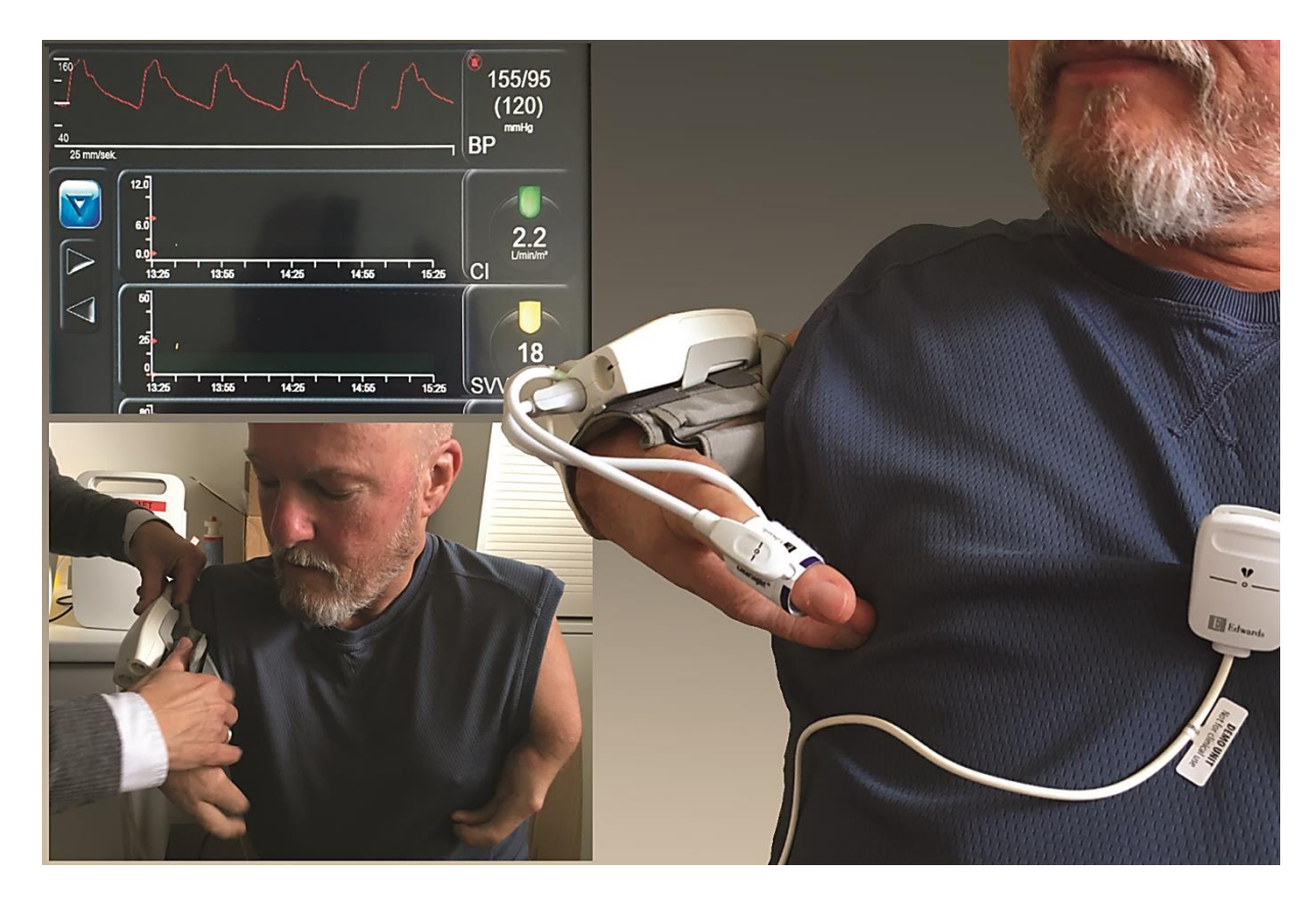
Figure 2: Edward Lifesciences ClearSight™ system with dysmelia of the upper limb

The working group headed by Prof. Dr.-Ing. K. Affeld, Charité - Universitätsmedizin Berlin, Laboratory for Biofluid Mechanics in Berlin, has developed a new method for noninvasive blood pressure measurement at the cheek (pressure of the facial artery)<sup>21</sup>. The measurements are based on a photoplethysmographic method. The method is not yet in use because the measurement algorithm on which it is based has not been sufficiently validated. As measurement is conducted independently of the limbs, this method would be very suitable for all individuals with dysmelia.