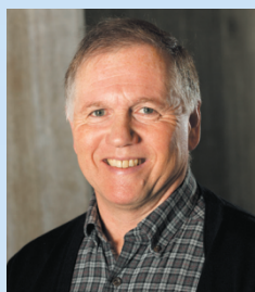
Vilhelm Bohr National Institute of Aging