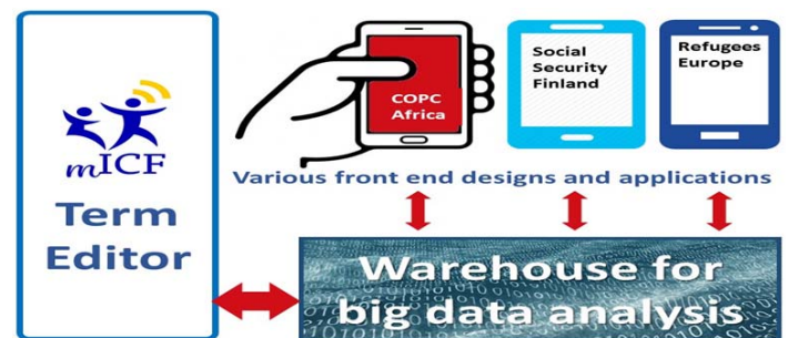
Figure 2: mICF vision of connection between various front ends, big data warehouse and Term editor

The mICF development includes big data analysis by connecting front end data capturing (the interface) with the back end (ICF Term Editor) (see figure 2). Currently the MVP prototype front end (interface) of mICF is bilingual in Finnish and English (see mock up derived from Finnish: https://projects.invisionapp.com/m/share/B77HCQ5XZ#/162952446 ). However, the front end can be of various interfaces and languages depending on the user group as presented in figure 2. For example: interfaces can be problem-oriented or goal-oriented. Currently, the back end (the Term editor) includes English, Finnish, Danish, Portuguese, Dutch, and German ICF terms. If funding becomes available, the plan is to add the Japanese, French, Chinese, Russian, Spanish and Swedish languages. The scalable design will allow the inclusion of all other languages as well. To link the natural terms to the ICF terms, a protocol has been developed and is in the process of ethical approval in several countries.