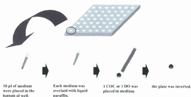
Fig. 1. Hanging drop (HD) method

The results showed that the nuclear maturation rate of H 2 O 2 (41.87 ± 2.30%) treatment group was significantly lower than that of the control (65.81 ± 3.92%). When LC or LF was added at 0.1 µg/ml in IVM medium supplemented with H 2 O 2 , the nuclear maturation rate was statistically significant against H 2 O 2 supplementation (LC: 60.30 ± 11.99%, LF: 68.77 ± 3.90%). Furthermore, the nuclear maturation rate was statistically significant by 0.01 µg/ml LF addition, and