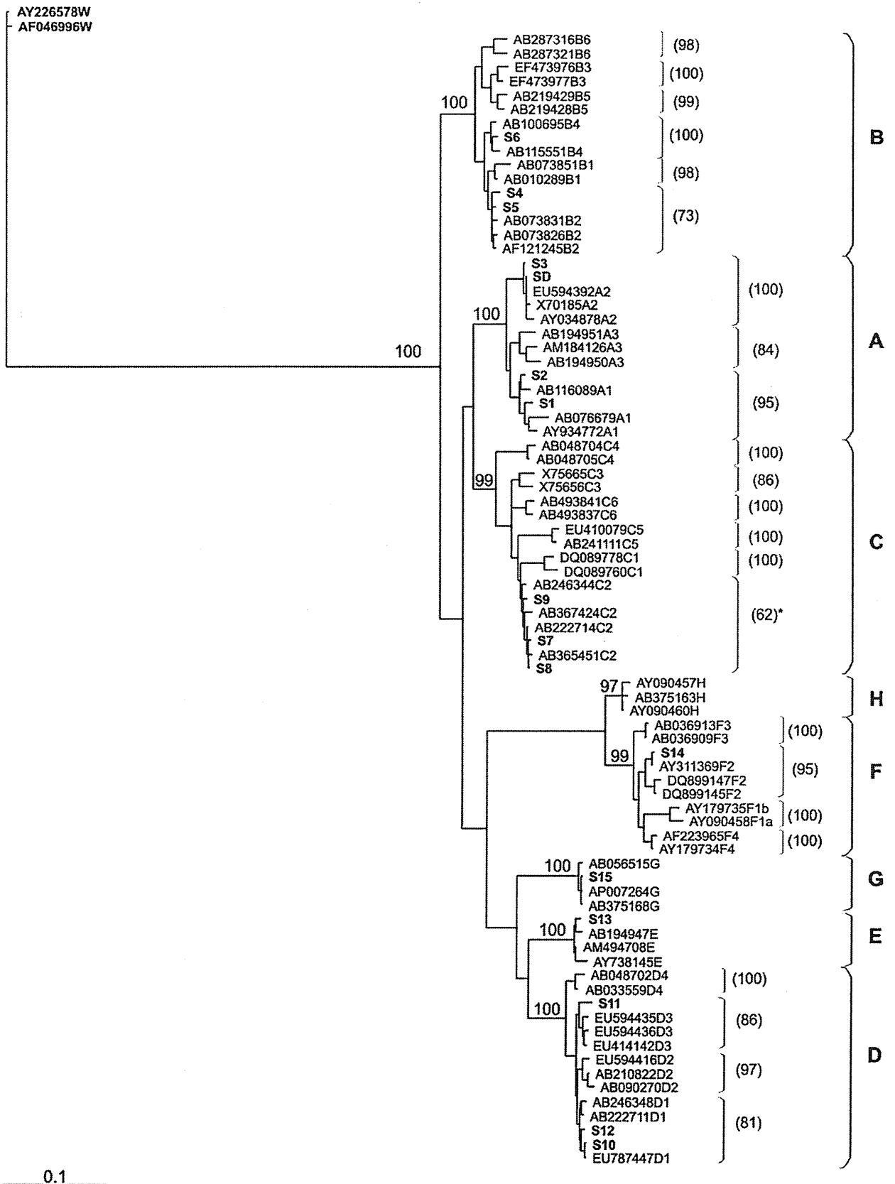
Fig. 1. Phylogenetic tree of HBV genotypes. Bootstrap values for genotype or subgenotype clusters are indicated. *This bootstrap support increased to 95 when bootstrapping was performed by Neighbour Joining method (1000 replicates).