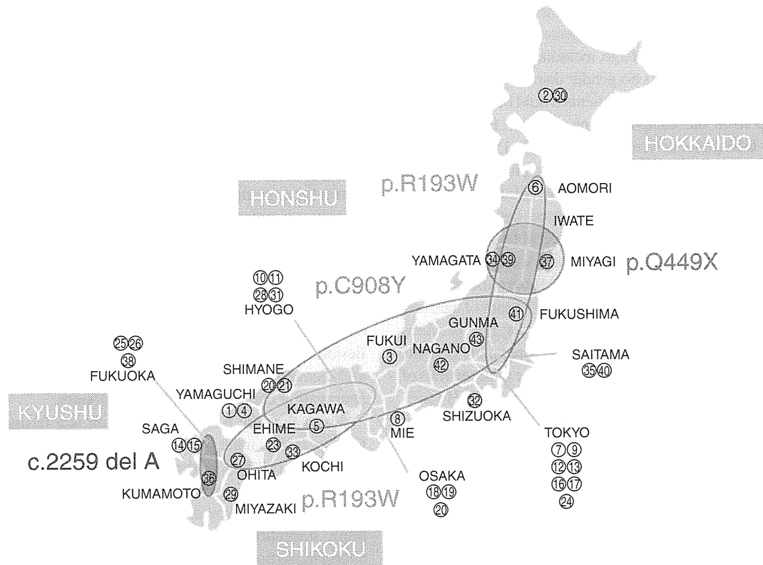
Fig. 1. Geographical distribution of 43 Japanese patients with USS and their ADAMTS13 gene mutations. Among 43 USS patients, an ADAMTS13 gene analysis was performed in 39 patients. Nine of the 39 USS patients had homozygous ADAMTS13 gene mutations, and 29 were the compound heterozygotes, including one patient (USS-W4: patient no 28) with disease-causing mutation (DCM) on one allele while the other was unidentified. In the remaining one patient (USS-X5: patient no 29), two single nucleotide polymorphisms (SNPs), p.P475S and p.G1181R, but not DCMs were identified on each allele. The p.Q449X mutation localised to the northern part (Tohoku) of Honshu, c.2259delA to Kyushu, p.C908Y to western Japan, and p.R193W to a relatively wide area across Japan. Circled numbers indicate the patients shown in Tables 1 and 2.