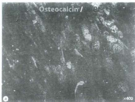
Fig. 1. Expression of osteocalcin and cell adhesion molecules in a primary culture of osteoblasts detected by immunohistochemistry. a Osteoblast primary culture grown on coverslips was stained with fluorescein-labeled antibodies to the osteocalcin and examined by confocal microscopy.

It is noteworthy that occasionally proliferation of CD19+ B-lineage cells on osteoblasts was observed, and one experiment revealed that 46.2 and 13.0% of the hematopoietic cells were B-lineage cells after 2 and 4 weeks of coculture, for example (data not shown). However, the proliferation of B-lineage cells seems to be dependent on the lot of human CD34+ bone marrow cells. Since CD34+ bone marrow cells contained a sizable population of CD19+CD34+ cells in those cases (data not shown), it is most likely that osteoblasts can maintain the B-lineage-committed cells rather than promote B-cell differentiation.